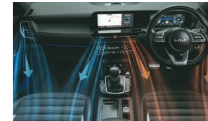
Remote AC Control