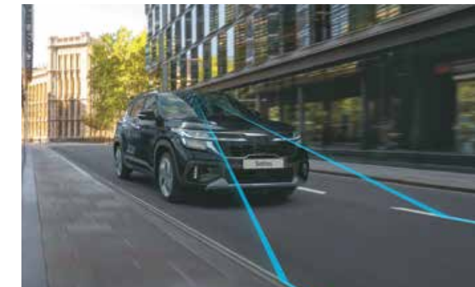
Lane Keep Assist (LKA)