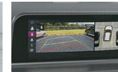
360° Camera with Blind View Monitor in Cluster