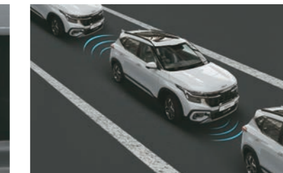
Attentive Front and Rear Parking Sensors