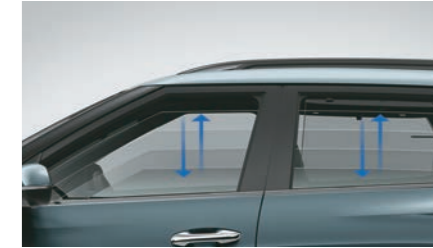
Voice Controlled Window Function