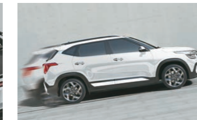
Electronic Stability Control (ESC), Hill Assist Control (HAC) & Vehicle Stability Management (VSM)