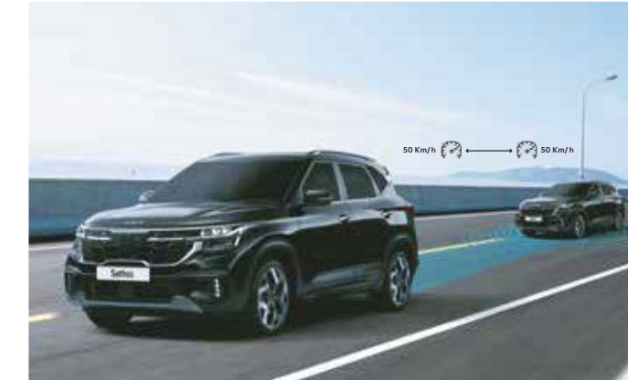
Smart Cruise Control with Stop and Go

The new Seltos helps you manoeuvre with badass confidence on the road with the help of an advanced automated technology - the Advanced Driver Assistance System (ADAS) encompassing 17 Autonomous Level 2 features. It uses camera and radars to detect any obstacle on your path or driver error and in turn, alerts the driver and activates possible safeguards in the car by automating driving controls. Thereby ensuring that you have a safer, more intuitive and rewarding driving experience.