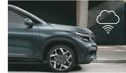
OTA Map & System Update