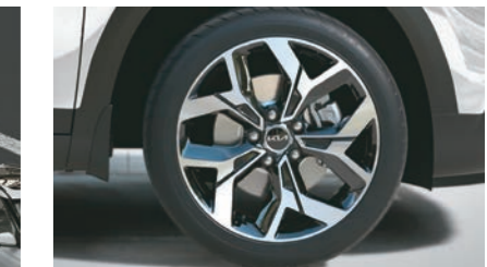
All Wheel Disc Brakes