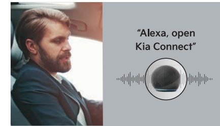
Kia Connect Skill with Amazon Alexa