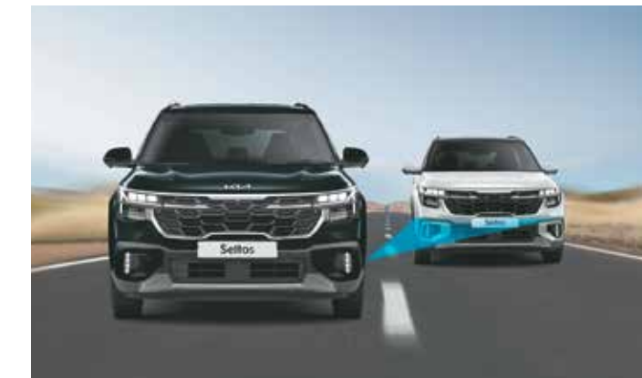
Blind Spot Collision Warning (BCW)