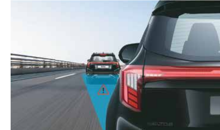
Front Collision Warning and Avoidance Assist (FCW and FCA)